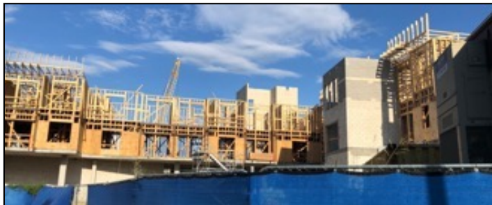
Austin Modern Lofts at Berkman