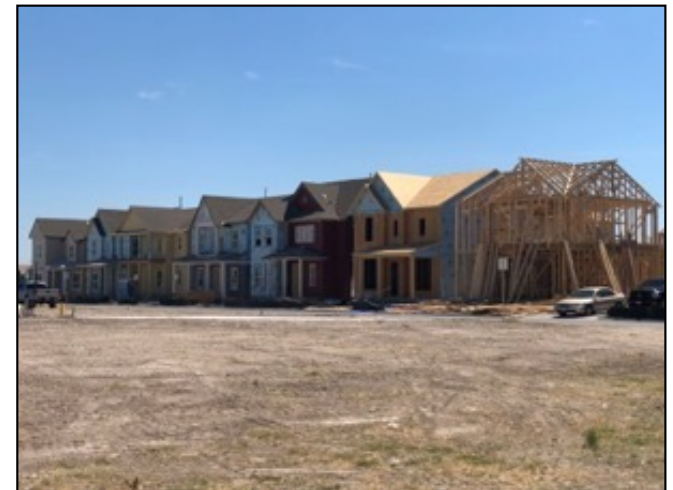
Section 11 Lots and Homes