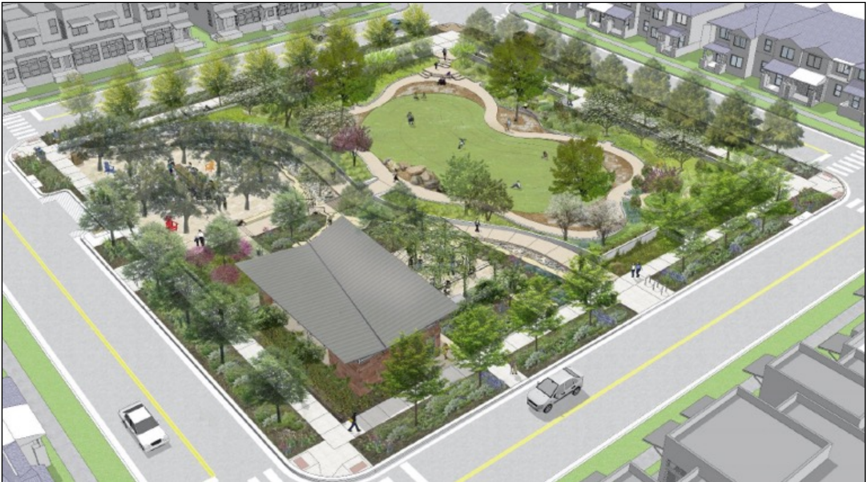
A rendering of Isamu Taniguchi Park