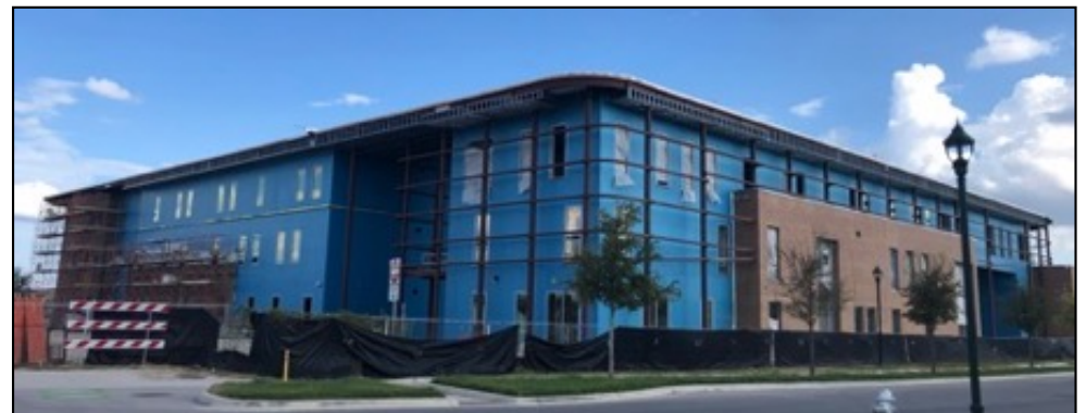
General Marshall Middle School site as of Sept 2022