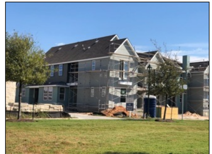
Mueller House Condos