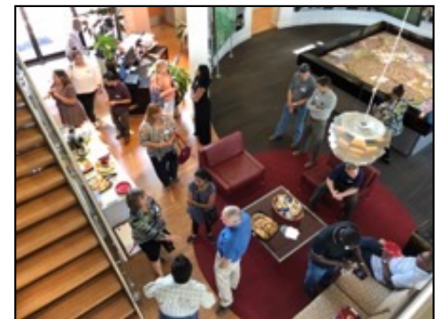
Networking event example