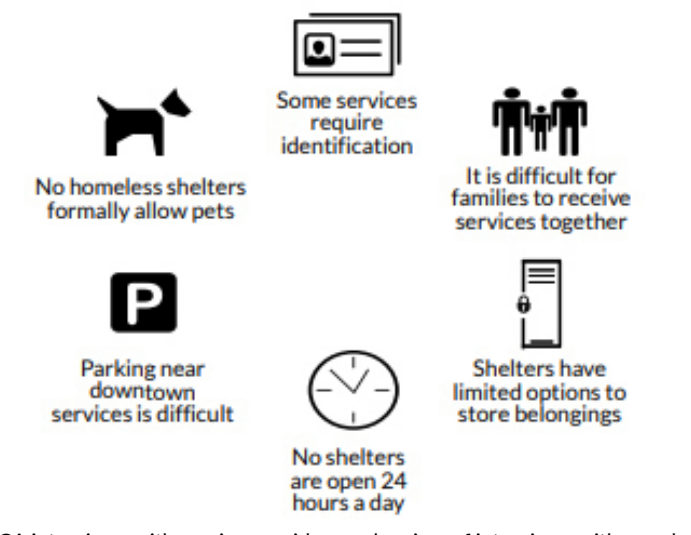
Exhibit 4: A person experiencing homelessness may face barriers when trying to access programs and services

SOURCE: OCA interviews with service providers and review of interviews with people experiencing homelessness, September 2018