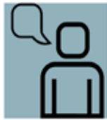
Exhibit 2: Austin City Ordinances Associated with Homelessness

The National Law Center on Homelessness and Poverty reviewed municipal codes in 187 cities to identify ordinances that relate to the criminalization of homelessness. According to this analysis, Austin has three such ordinances, which are shown in Exhibit 2. Violations of each ordinance are classified as a Class C misdemeanor and can result in a fine of up to $500.