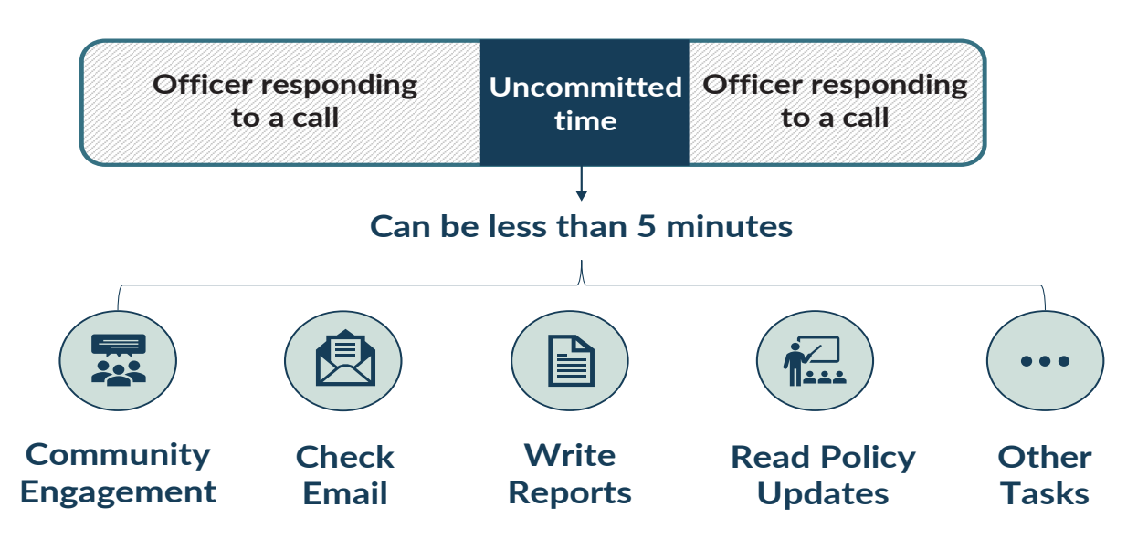
Exhibit 2: Uncommited time can be less than five minutes and is used for a variety of activities