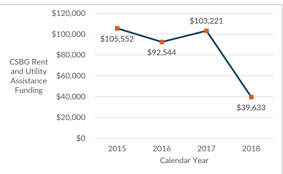
Exhibit 6: Community Services Block Grant Funding for Rent and Utility Assistance

a job or are able to work and are enrolled in Neighborhood Center case management. For the past three years, approximately $100,000 was allocated to rent and utility assistance, but management stated that the amount of funding available for this program will decrease over $60,000 in 2018 due to an $11,000 reduction in CSBG funding and increases in personnel costs paid for using grant funding, as shown in Exhibit 6.