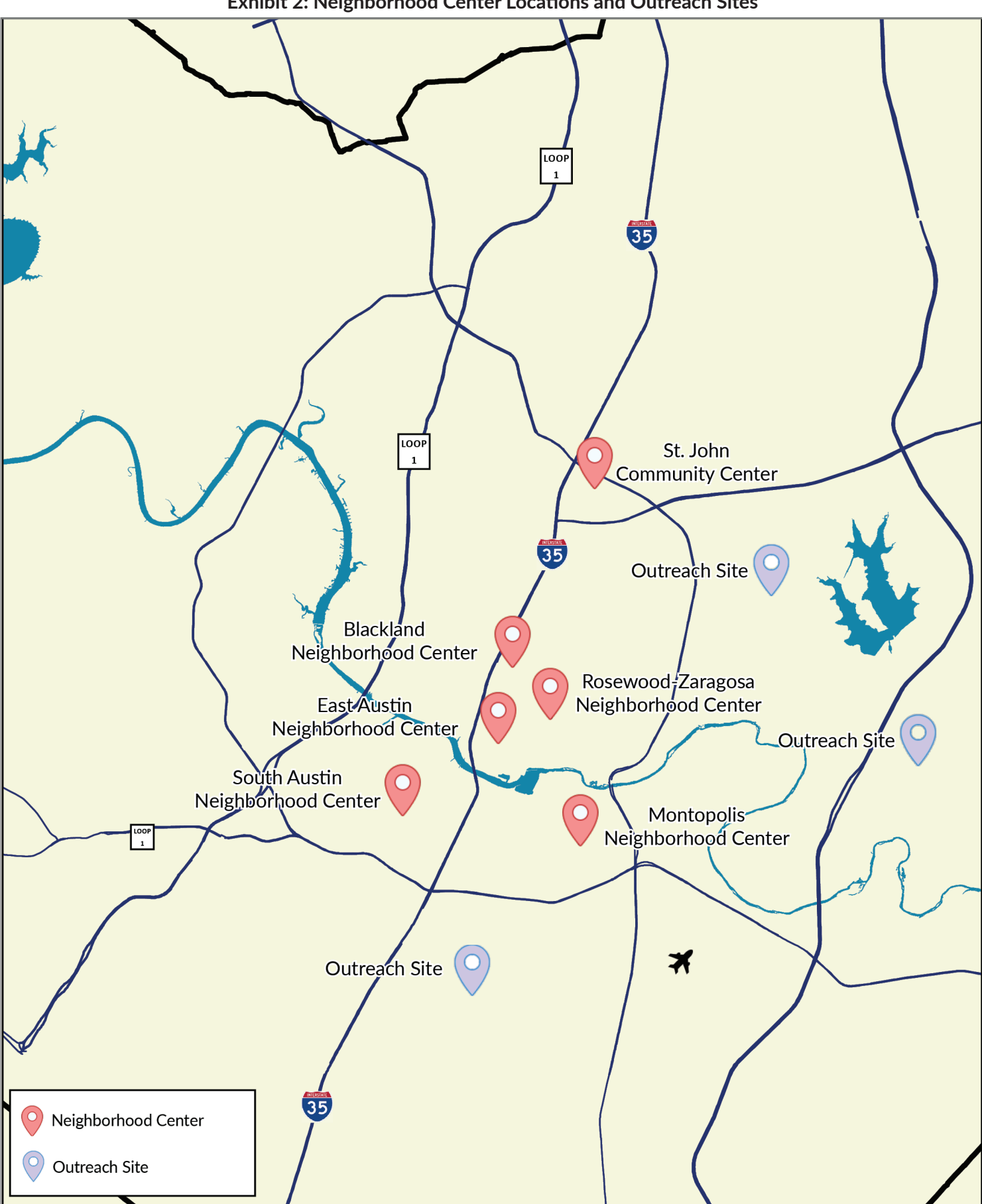
Exhibit 2: Neighborhood Center Locations and Outreach Sites

SOURCE: OCA Map of Austin Public Health Neighborhood Center Locations and Outreach sites, September 2017.