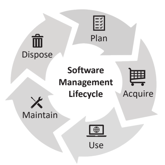
Exhibit 1: The Software Management Lifecycle Consists of Several Phases