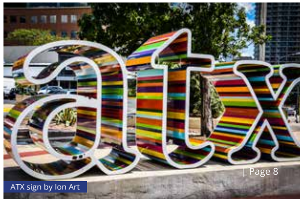
ATX sign by Ion Art