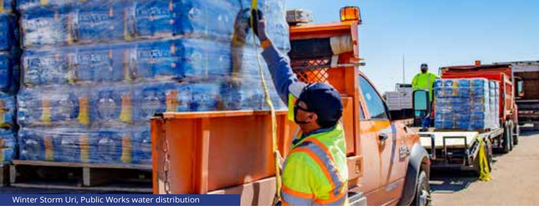
Winter Storm Uri, Public Works water distribution

infrastructure, and the improvement and maintenance of water and wastewater infrastructure.