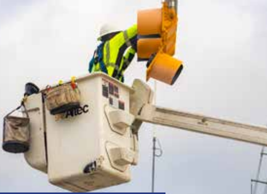
Signal Technicians at Parmer and Samsung Blvd