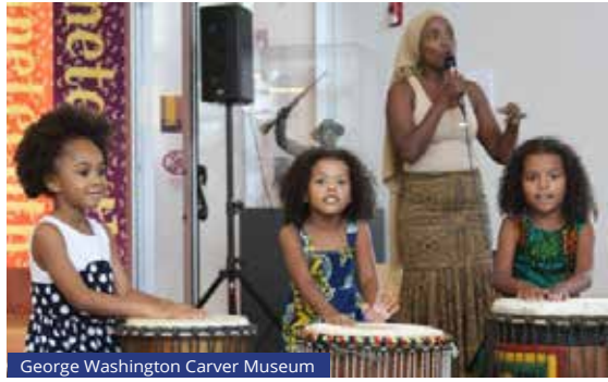
George Washington Carver Museum