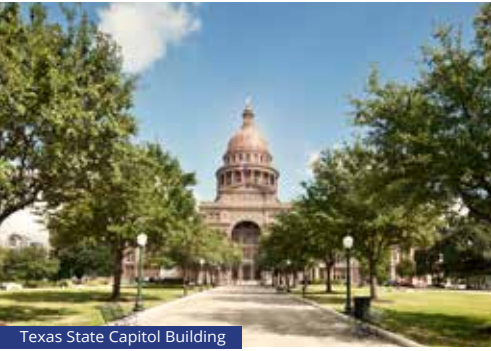
Texas State Capitol Building