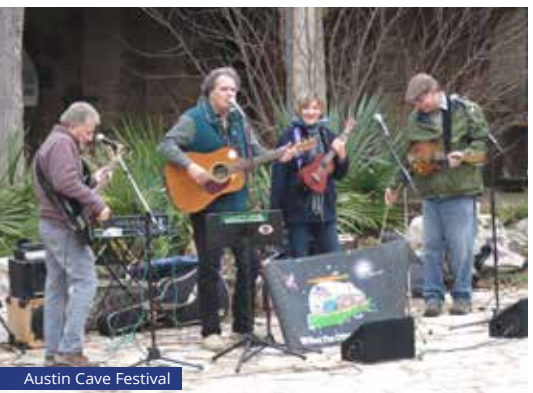
Austin Cave Festival