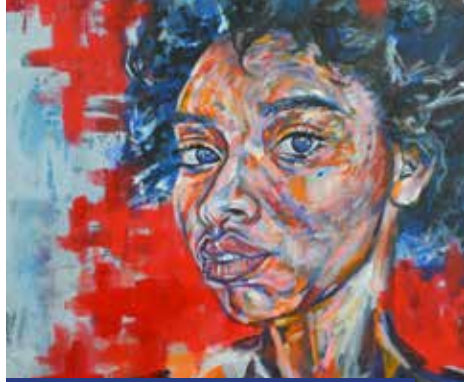
Vy-Ngo, Blue , The People's Gallery: Austin City Hall