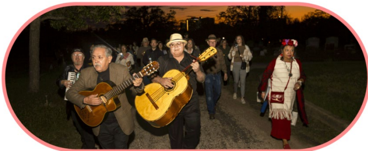
EMMAS . BARRIENTOS MEXICAN AMERICAN CULTURAL CENTER FY23 ANNUAL REPORT

We have published our " Annual Report " that highlights our major programs and events in 2023.