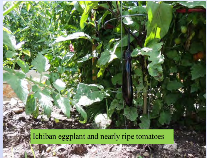
Ichiban eggplant and nearly ripe tomatoes