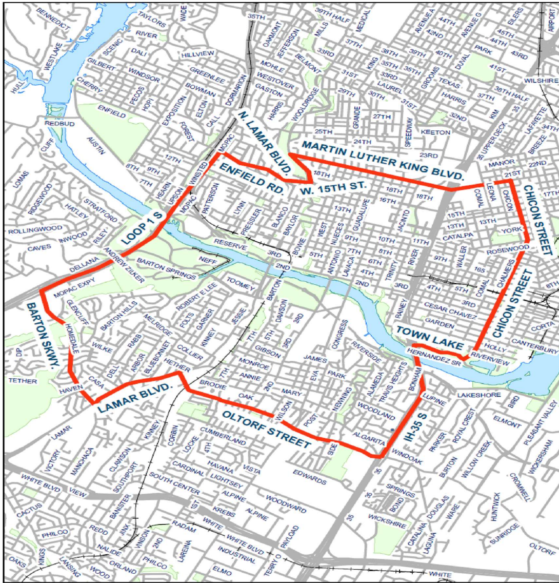
DOWNTOWN AUSTIN PROJECT COORDINATION ZONE (DAPCZ)

P.O. Box 1088 Austin, TX 78767 512-974-1150