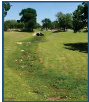
Stormwater channel upslope of the cave.

It is important for the stormwater that enters the cave to be clean. The wall around this cave reduces pollution from urban runoff from entering.