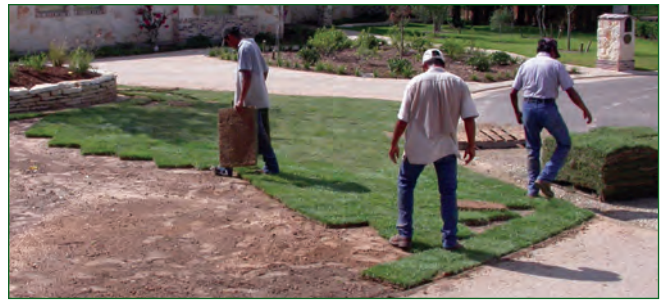
Figure 4. Sod installation.

Sodding. The firm soil surface should be free of footprints, stones, depressions and mounds. Sod is perishable and should be installed within 36 hours of harvest. If you see mildew or yellow grass leaves as you pull the pieces off the pallet, it is evidence of “sod heating” injury, which happens when sod is left on the pallet too long. Do not plant such sod.